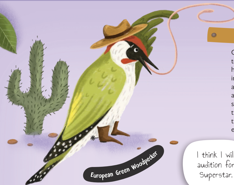
European Green Woodpecker

Green woodpeckers don't need too much comfort or a cosy home. They hollow out a hole in the tree and lays eggs without any bedding. Green woodpeckers aren't wallflowers. They have strong beaks and robust legs with two toes turned to the front and two to the back which makes it easier to climb.