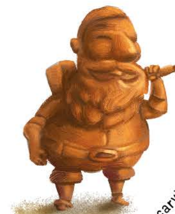
Grandpa's favourite carvings are dwarves. They're funny.