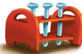
Each test tube contains water from a different pond.