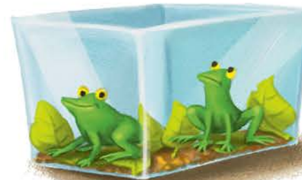
It is said that frogs can forecast the weather.