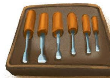
screwdrivers of various sizes