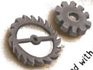
The desk is covered with gears.