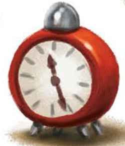
Our broken alarm clock.