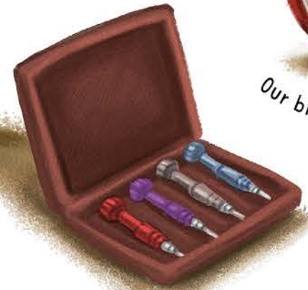
I'd like a set of mini-screwdrivers just like this.