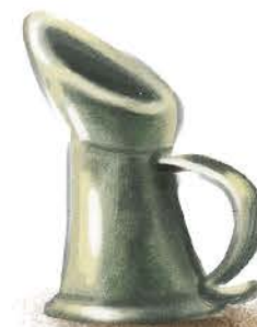
old-fashioned beer jug