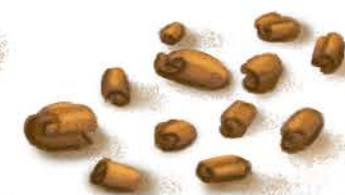
There are shavings everywhere. Sometimes I find them on my cap!